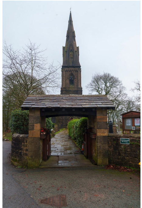
Holcombe Church where Ellen Strange was laid to rest