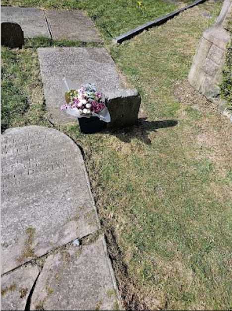
Final resting place for Ellen Strange at Emmanuel Holcombe Church