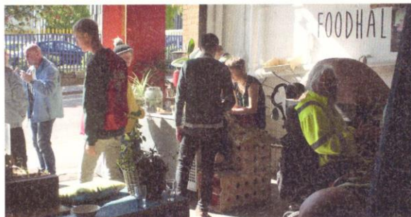
As well as being a community kitchen Sheffield Foodhall hosts events

The success of these initiatives inspired like-minded people across the country to imitate the work. There are now 15 similar groups including ones in Bristol and London.