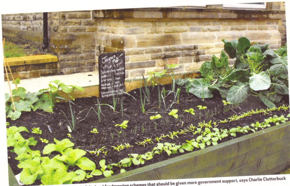
Incredible Edible Todmorden is typical of the local foodgrowing schemes that should be given more government support, says Charlie Clutterbuck