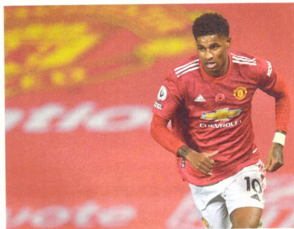
Marcus Rashford is a role model to working-class kids.

Government guidelines recommend that young people