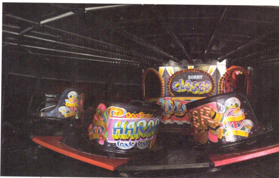
Off season at the pier at Walton-on-the-Naze, Essex, by OCA photographer Ashley Blair, reflecting the low incomes and lack of job opportunities in rural coastal towns as overheads rise.

The Open College for the Arts (OCA) is a thriving online community of more than 3,000 people studying creative arts subjects at higher level. An education charity, OCA offers BA honours degrees in photography, painting, creative writing, visual communications and textiles. Students