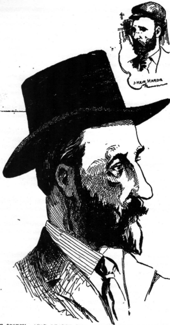
THE SCOTCH LABOR LEADER WHO HOPES TO FORM A UNION OF 10,000,000 MEN.